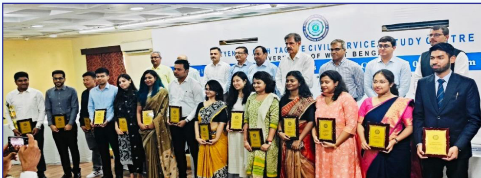
Felicitation Programme of Successful Candidates (UPSC CSE 2023)