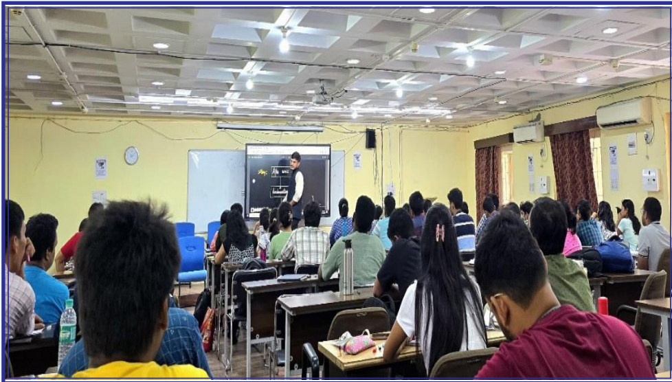
Classroom of Section A