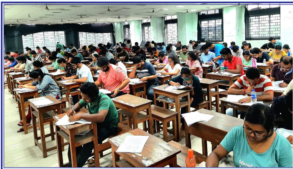
Admission Test for Composite Course Batch 2025

Result of the Admission Test was published on website ( https://www.csscwb.in ) on 08.06.2024.