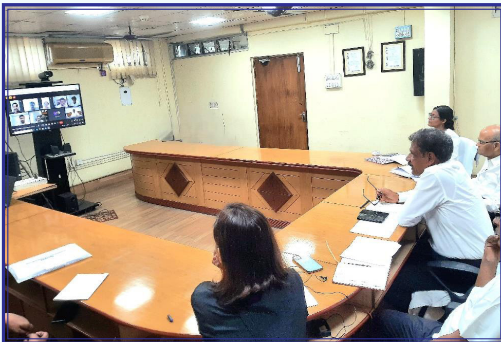
Interactive Session (virtual) with the students of Mains Guidance Programme 2024