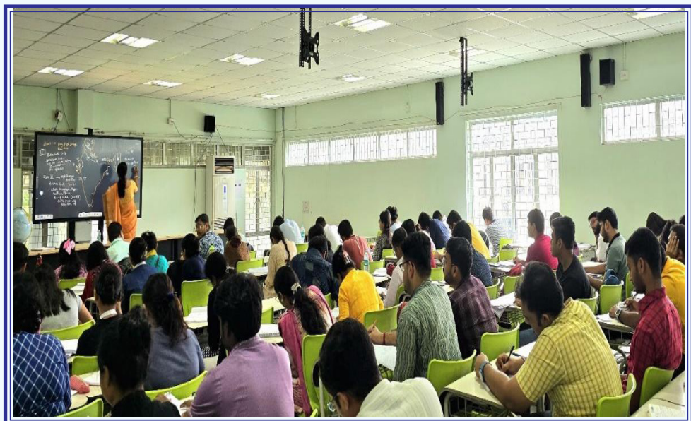
Classroom of Section B