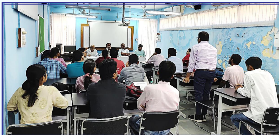
Interview Training Session for 2024 Batch