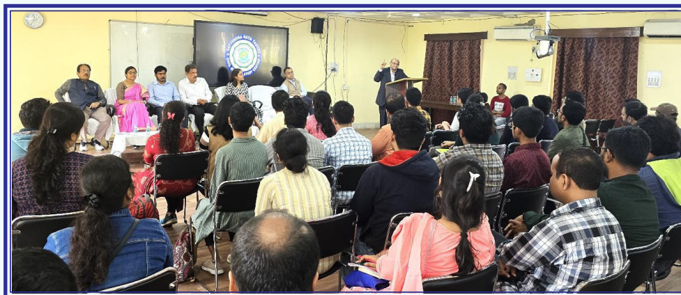
Interactive session with the students of Prelims Crash Course 2024

Prelims Crash Course is designed to benefit a significantly larger number of aspirants. Most of that aspirants are not enlisted with SNTCSSC for the Composite Course but have chosen to appear in the current year's Prelims Test. The duration of the course ranges from 8 to 10 weeks and is held immediately prior to the date of the Prelims examination of that year set by the UPSC. Mock Tests are conducted for students enrolled in the Crash Course.