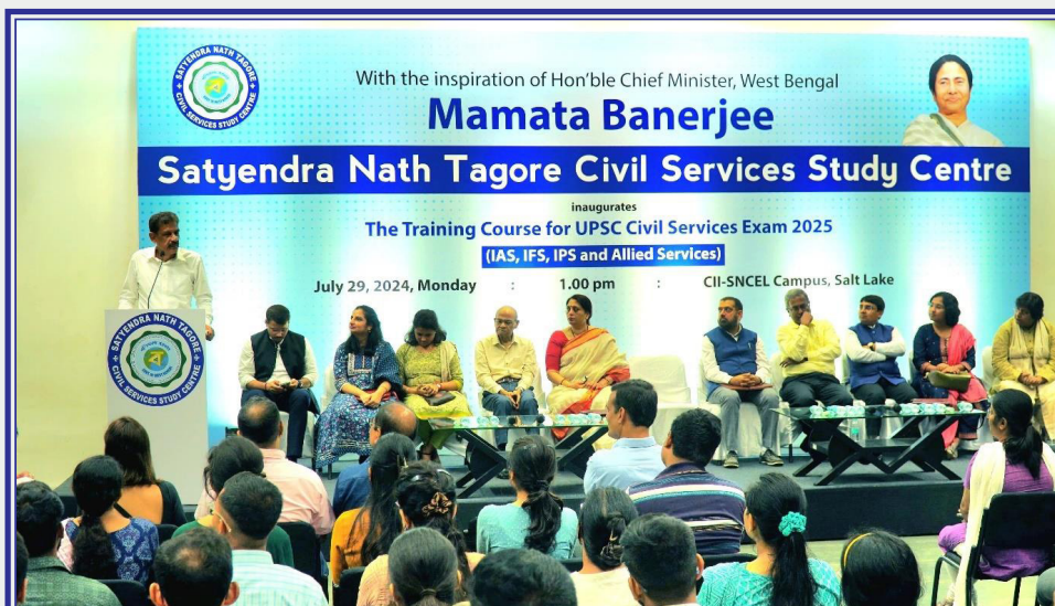
Inaugural Session of 2025 Batch

Classes commenced on Friday, August 2 nd , 2024